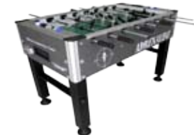
↻Roberto Sport (Italy)